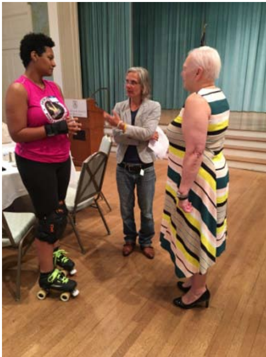
A Derby participant mingled to share her adventures.