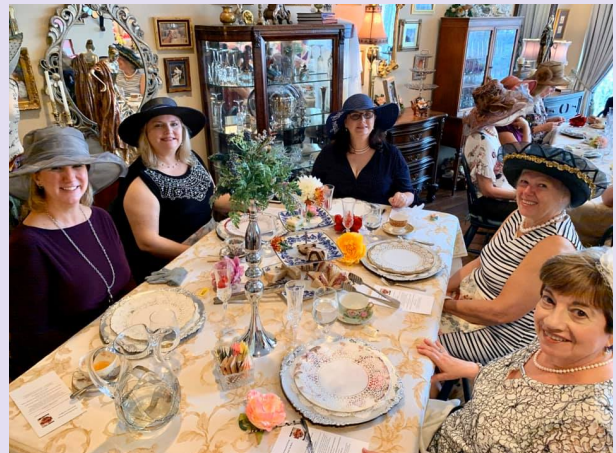
Such a fabulous time at the TPG Autumn Afternoon Tea!