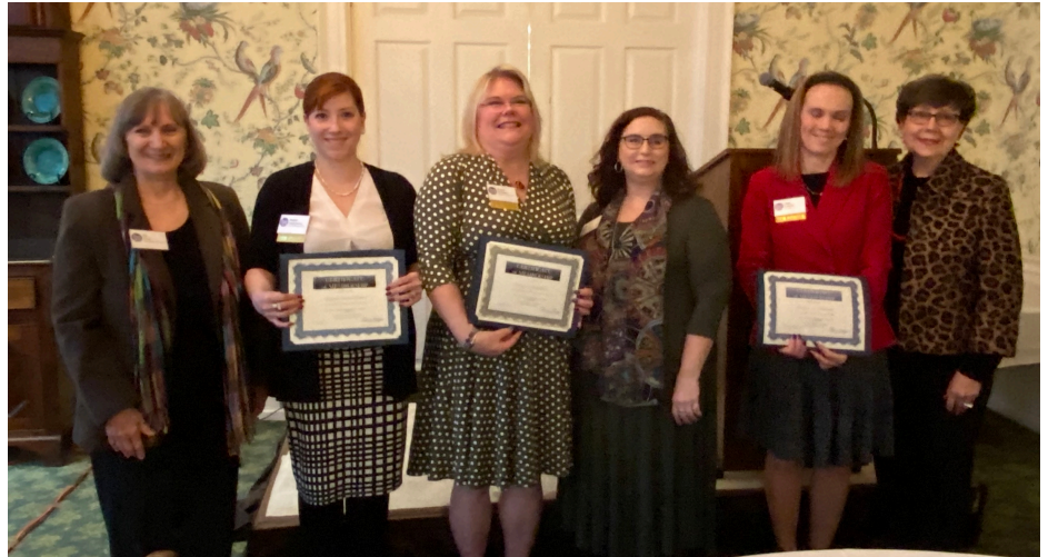
December Breakfast Meeting